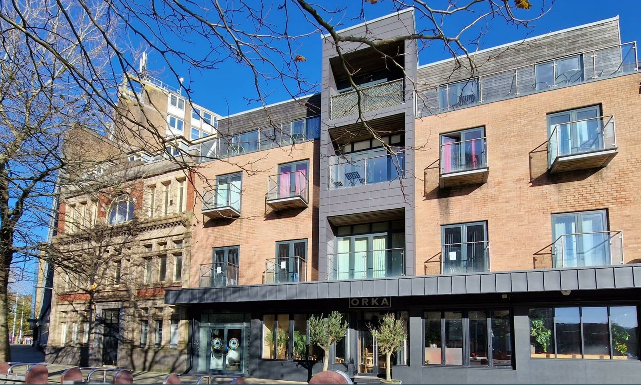
Princess Lofts 6 Princess Way Swansea, SA1 3LW £700 PCM